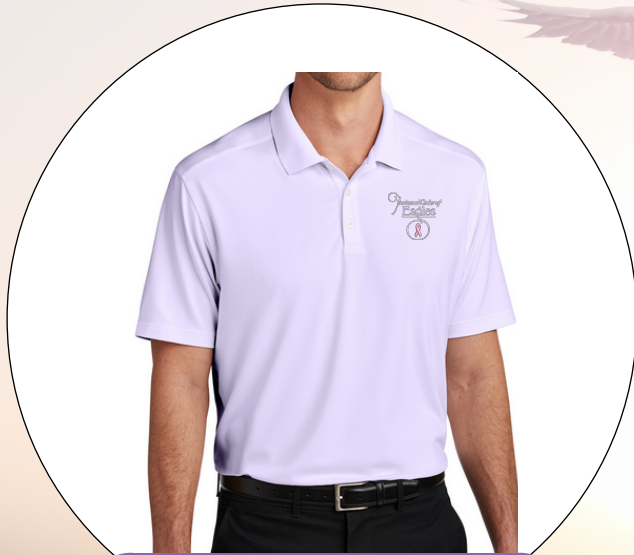
7 Members Polo Shirt