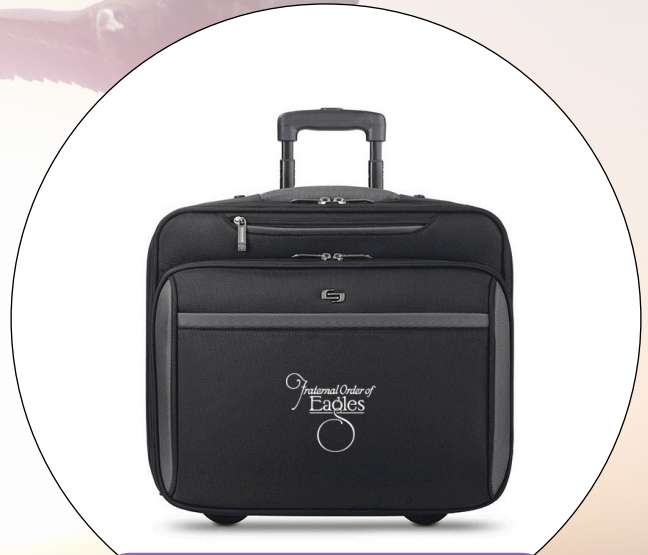
30 Members Computer Bag

For every member you sign, you're entered into a drawing for 1 of 10 $500 prizes.